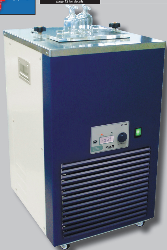
WCT-40 with 2x glass cold trap (included)